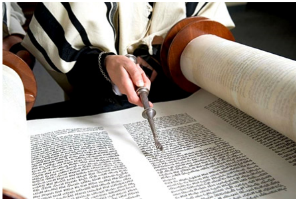
Reading the Torah scroll with a pointer called a yad (literally, hand).

Modern Day Example of the letter "yad", literally meaning, "hand":