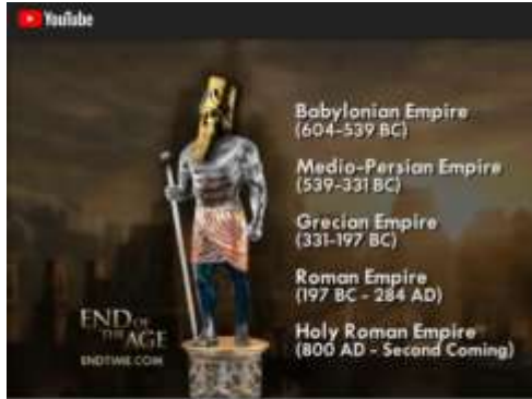
End times Holy Roman Empire: Reborn part7