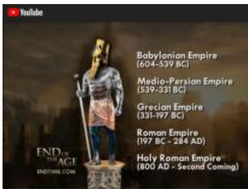
End times Holy Roman Empire: Reborn part7

24 “ Seventy weeks (or 490 years) are decreed about your people and your holy city, to finish the transgression, to put an end to sin, and to atone for iniquity, to bring in everlasting righteousness, to seal both vision and prophet, and to anoint a most holy place. 25 Know therefore and understand that from the going out of the word to restore and build Jerusalem to the coming of an anointed one, a prince, there shall be seven weeks (or 49 years). Then for sixty-two weeks (or 483 years) it shall be built again with squares and moat, but in a troubled time. 26 And after the sixty-two weeks, an anointed one shall be cut off and shall have nothing. And the people of the prince who is to come shall destroy the city and the sanctuary. Its end shall come with a flood, and to the end there shall be war. Desolations are decreed. 27 And he shall make a strong covenant with many for one week (or 7 years), and for half of the week (or 3 ½ years) he shall put an end to sacrifice and offering. And on the wing of abominations shall come one who makes desolate, until the decreed end is poured out on the desolator. ”