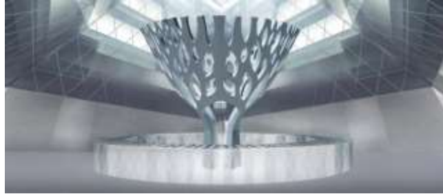
The Peace Tree.

NUR-SULTAN – The five-meter-tall Peace Tree will be built at the capital’s Palace of Peace and Reconciliation as a symbol of the upcoming seventh Congress of World and Traditional Religions, scheduled for Sept. 14-15, reported Khabar TV channel on Sept. 8.