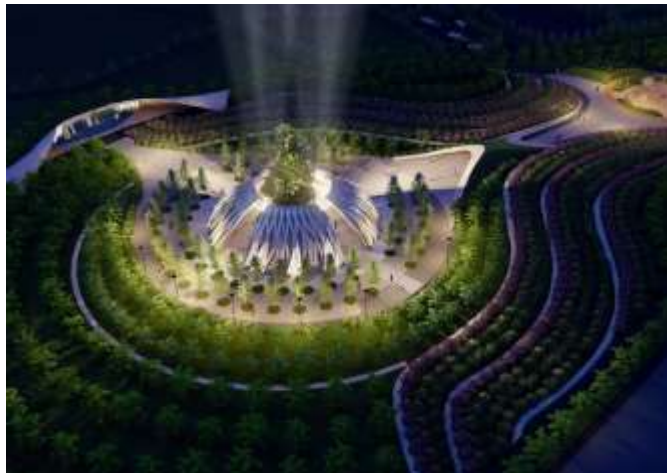
The Tree of Life.

The Tree of Life monument will be the focal point of the park. It will have a form of a dome with oak in the center, surrounded by a spiral and a fountain. The delegates of the upcoming congress will assist in laying the foundation for the future park dedicated to the seventh Congress of World and Traditional Religions.