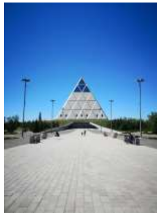
Palace of Peace and Reconciliation