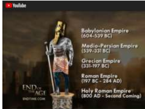
End times Holy Roman Empire Reborn part7